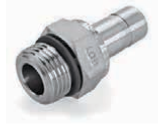
TUBE (INCH) TO SAE/MS STRAIGHT THREAD BOSS***